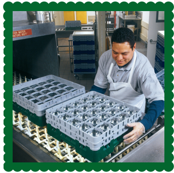
1. Efficient Washing