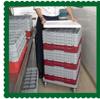
2. Sanitary Storage