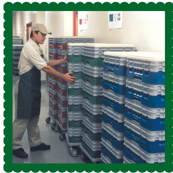
3. Inventory Management