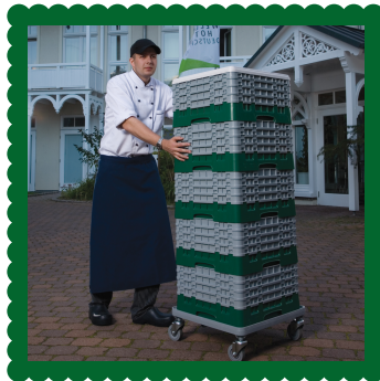
4. Safe & Sanitary Transportation

The first thing customers look for to judge the cleanliness of a restaurant is the glassware, flatware and dinnerware. Cambro can help insure your brand with our exclusive 4 in 1 system that will protect your glassware from the time it exits your dishwasher to when the glass is placed on the table helping keep your customers safe. No other glass rack can provide effective washing, sanitary storage, efficient inventory management and safe and sanitary transportation. Our innovative "closed wall design" will protect your glassware from dirty fingers, rodents, bugs and other contaminants that easily enter through common open wall glass racks. The benefit is clean tableware for your customers. And Camracks eliminate the need to rewash your glassware which saves on electricity, water, chemicals, labor, plastic film and helps preserve our environment.